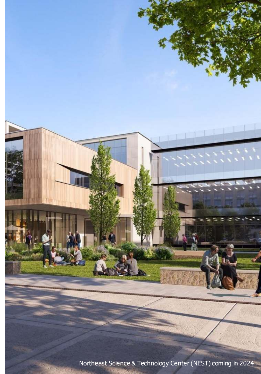
Northeast Science & Technology Center (NEST) coming in 2024