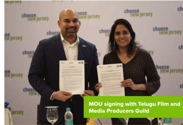
MOU signing with Telugu Film and Media Producers Guild

India remains one of our top priorities for business attraction, which is why we've visited India three times in four years and plan to keep that momentum going with future missions and initiatives to connect our economies more closely.