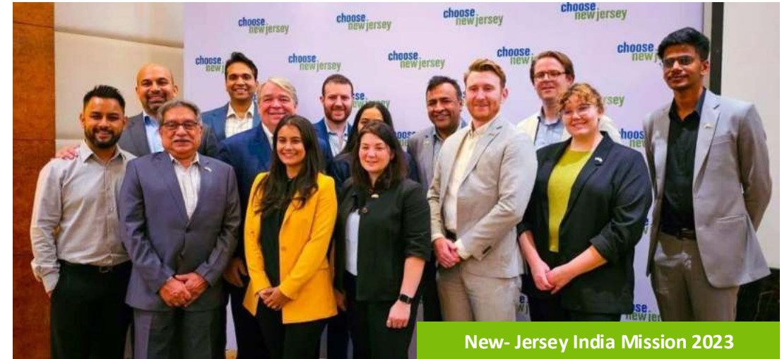
New- Jersey India Mission 2023