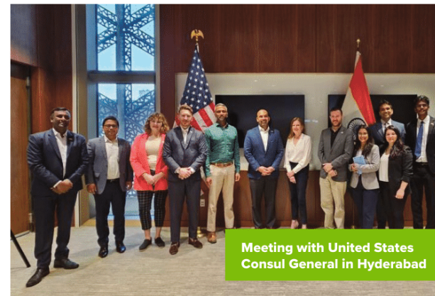
Meeting with United States Consul General in Hyderabad