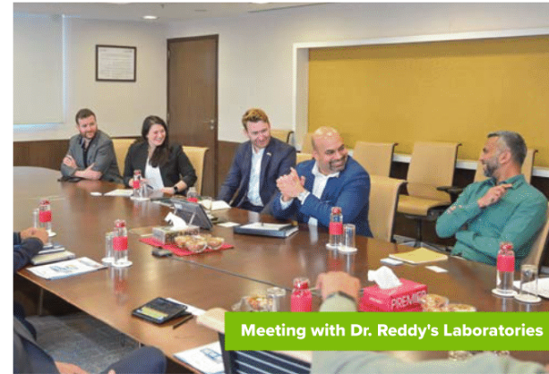
Meeting with Dr. Reddy's Laboratories